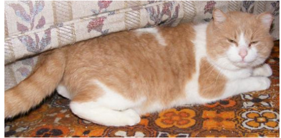
TOFFEE – still shy – around the time he was first rescued

http://www.youtube.com/watch?v=nIUBkCkhiQI&feature=related